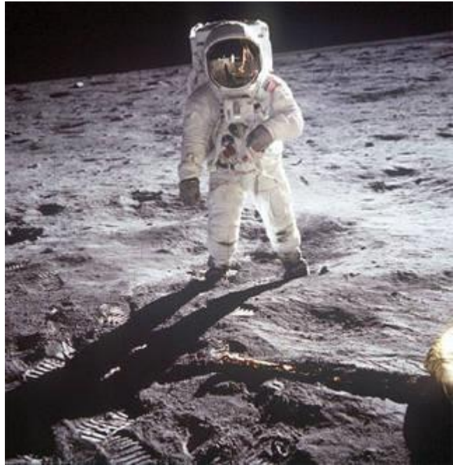
3 Buzz Aldrin was part of the first crew to land on the moon.

The first manned mission to the moon was Apollo 8. It circled around the moon on Christmas Eve in 1968. However, Apollo 8 did not land on the moon. It orbited the moon, then came back to Earth. The crew was Frank Borman, Bill Anders and Jim Lovell.