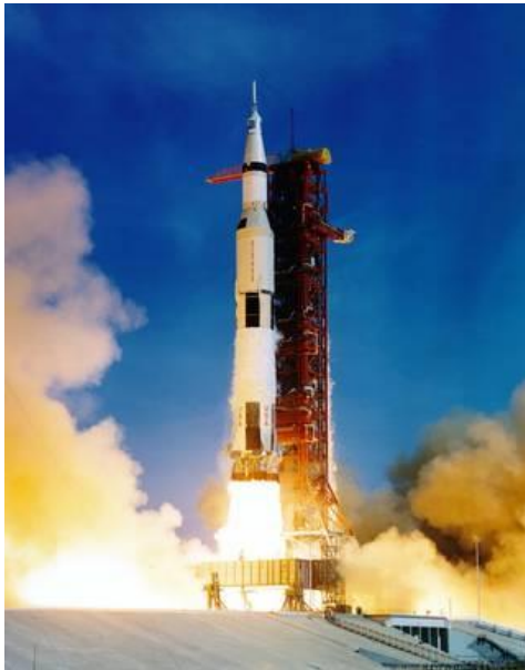
2The Saturn V (5) rocket was used for the moon landing missions.

A total of 12 astronauts walked on the moon. The astronauts conducted scientific research there. They studied the lunar surface. They collected moon rocks to bring back to Earth.